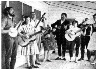
(pic 6 The Union Singers)