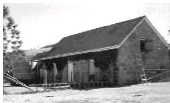
(pic 1) Taromeo homestead, the Stone House