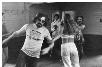
(pic 2) Fling Thing Dances c 1972

Bush Dances became very popular and the Queensland Folk Federation ran a monthly Saturday afternoon Fling Thing at the Foresters' Lodge Hall in Paddington. Ed]2b46a31.jpgThe Barley Mow subsequently operated for some years out of St Paul's Church Hall in East