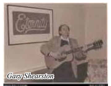
The CORNSTALK Gazette - AUGUST 2007 11

[Reprinted, with kind permission of the author and the editor, from Drumbeat (Folk Federation of Tasmania, May 2007.) Part 4 appeared in the July 2007 issue of Cornstalk.